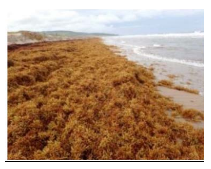
Image 2. Large accumulations of Sargassum fluitans , known as 'the sargassum seaweed' in the Caribbean. (image ©H.Oxenford extracted from Doyle and Franks, 2015).

Overall, there is limited information on invasive species in some of the islands and the information available is still in its infancy. There is a need to document sightings and distribution of these species. Furthermore, it is also important to assess the ecological trade-off that the invasive species will have over the native fauna to gain an understanding on the overall repercussions for biodiversity effects in these areas.