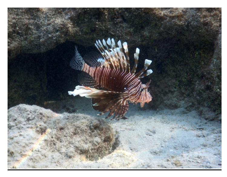
Image 3. The invasive Indo-Pacific lionfish Pterois volitans .

There is clear concern on the risks to small islands from climate change effects, which could be originating well beyond the borders of specific countries and/or islands. These transboundary processes could have a negative impact on small islands with strong evidence that this may be the case. For island communities, the risks associated with existing and future invasive species and human health challenges are projected to grow under climate change effects (Nurse et al., 2014). The effects of climate change may act as a multiplier of existing