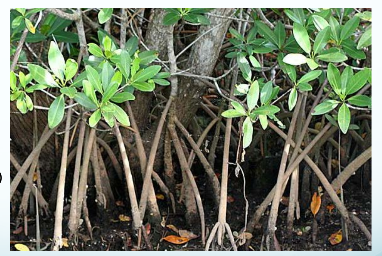
The common red mangrove