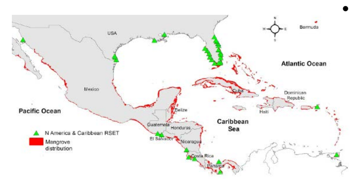
Figure 1: Distribution of mangroves and locations of mangrove RSETs in North America and the Caribbean. Data derived from Giri et al. (2011a).