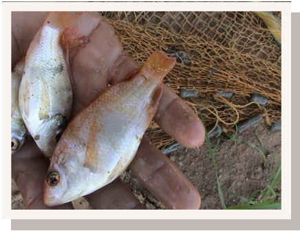
Producing quality, disease free fingerlings is important to the survival of the sector.