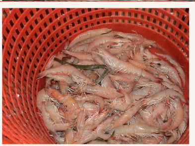
Photos shows processed catfish, shrimp, and prawn, a few of the, marine species being farmed in the region.