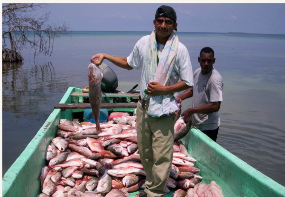
The FAO states that aquaculture is production expected to overtake wild capture in a few years.

The CRFM aims to promote the growth and development of the aquaculture industry to satisfy the current and growing demand for fish.