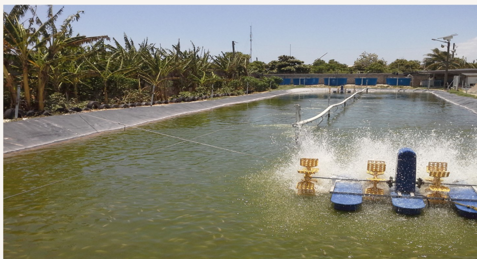
A fish pond in Haiti, where the sector has taken off in recent years.