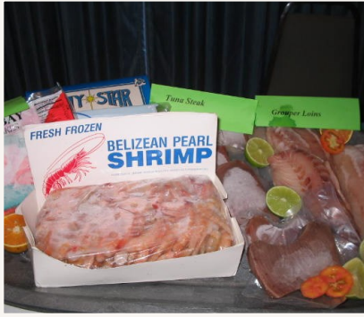
Commercial packaging of aquaculture products