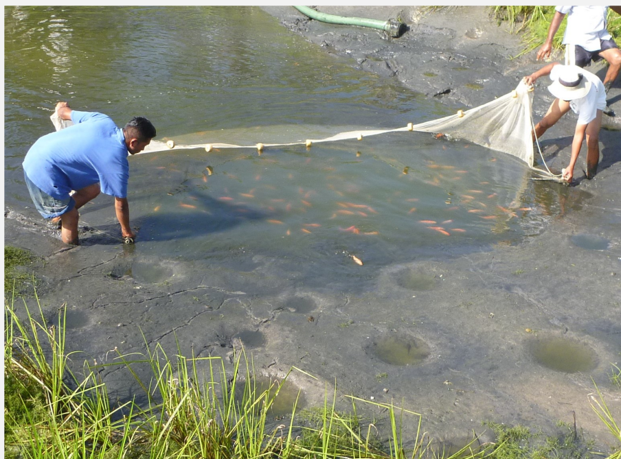
CRFM estimates that with help, regional Aquaculture can grow significantly once again.

Overall aquaculture production for the region fell from around 11,000 metric tonnes in 2010 to just over 7,700 in 2011. Farmers complain of growing production costs, theft and shrinking markets, primary competition from Asian countries.