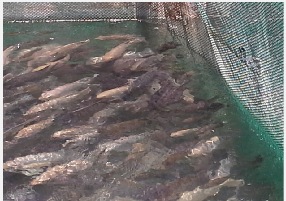
Farmed fish in a net.

It is expected, however that any growth in the region must be considered within the context of sustainability and with regards to the environmental, social and economic impacts. It is also expected that as other member countries begin to farm more of the over 500 aquatic species that are currently being farmed worldwide, the region will see more foreign exchange earnings, more employment among the poor and improved performances in the region's fishing industry.