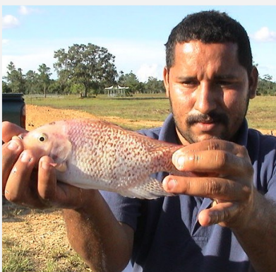
Access to Research and Development to reduce the impact of diseases and improve the quality of fish is important to the growth and development of Caribbean Aquaculture.

The expansion of the regional aquaculture industry is therefore expected to play a significant role in increasing the overall food fish production and availability in the region and contribute to a reduction in the very high food import bill.