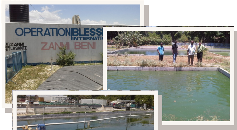
Aquaculture is growing in Haiti