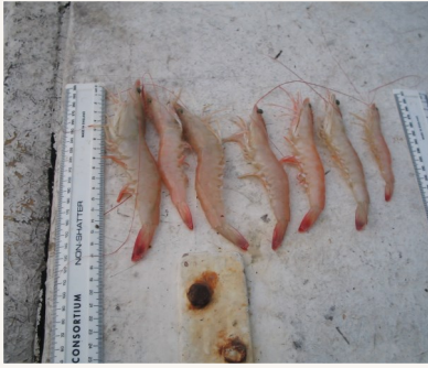
Shrimps graded according to size