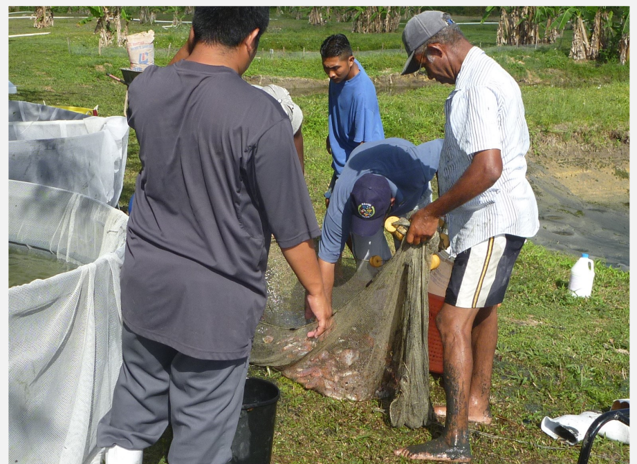
Catching fish from a pond on one of several farms in the Caribbean.

“Based on its dynamic performance over the last 30 years, with the fairly stable catches from capture fisheries, it is likely that the future growth of the fisheries sector will come mainly from aqua-culture” ...FAO