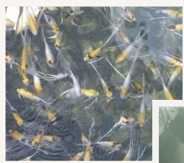
The ornamentals sector is a small but lucrative business in the region