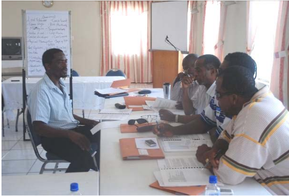
Final CERMES communications workshop in Nevis

C ERMES has completed training of 88 fisheries stakeholders across five eastern Caribbean territories in the fundamentals of communication skills and techniques as a means of building capacity for networking and advocacy within the industry.